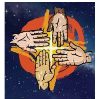
Centre canadien d'œcuménisme / Canadian Centre for Ecumenism

During the week we pray for the unity that Jesus himself prayed for at the Last Supper: “that they may all be one; even as you, Father, are in me, and I in you, that they also may be in us, so that the world may believe that you sent me.” John 17.21