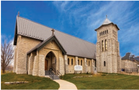
ST. ANDREW'S - BRECHIN