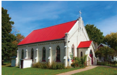
SACRED HEART - WARMINSTER