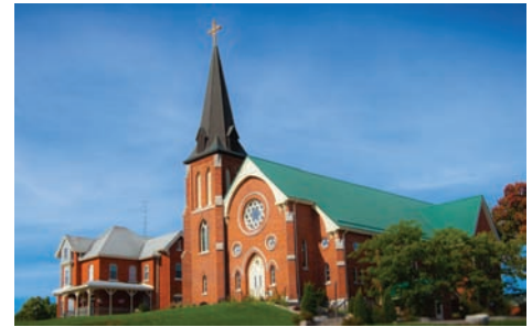
ST. COLUMBKILLE - UPTERGROVE